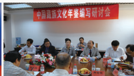
The seminar on preparation of the Chinese Tibetan Culture yearbook was held at MUC.