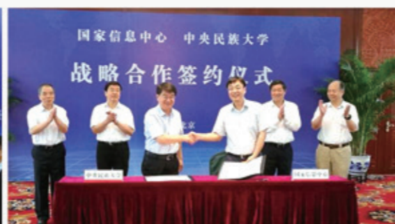
MUC and the State Information Center jointly established the Big Data Center for Ethnic Culture of the Belt & Road Initiative