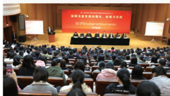
Collaborative Innovation Center for Ethnic Minority Development and the School of Economics jointly hosted the "Forum of Targeted Poverty Alleviation for Ethnic Minority Regions of China"

Beijing Research Center for Food Environment and Health Engineering Technology