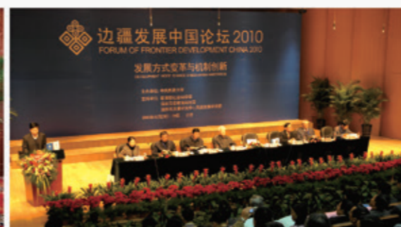
The Forum for Frontier Development China 2010 was held at MUC.