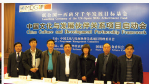
Participation in UNESCO cooperation projects