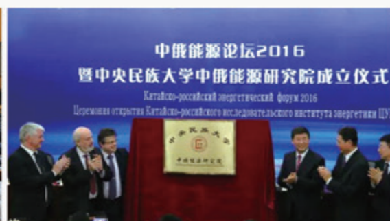
China-Russia Energy Forum 2016 and the inauguration ceremony of the China-Russia Energy Research Institute held at MUC